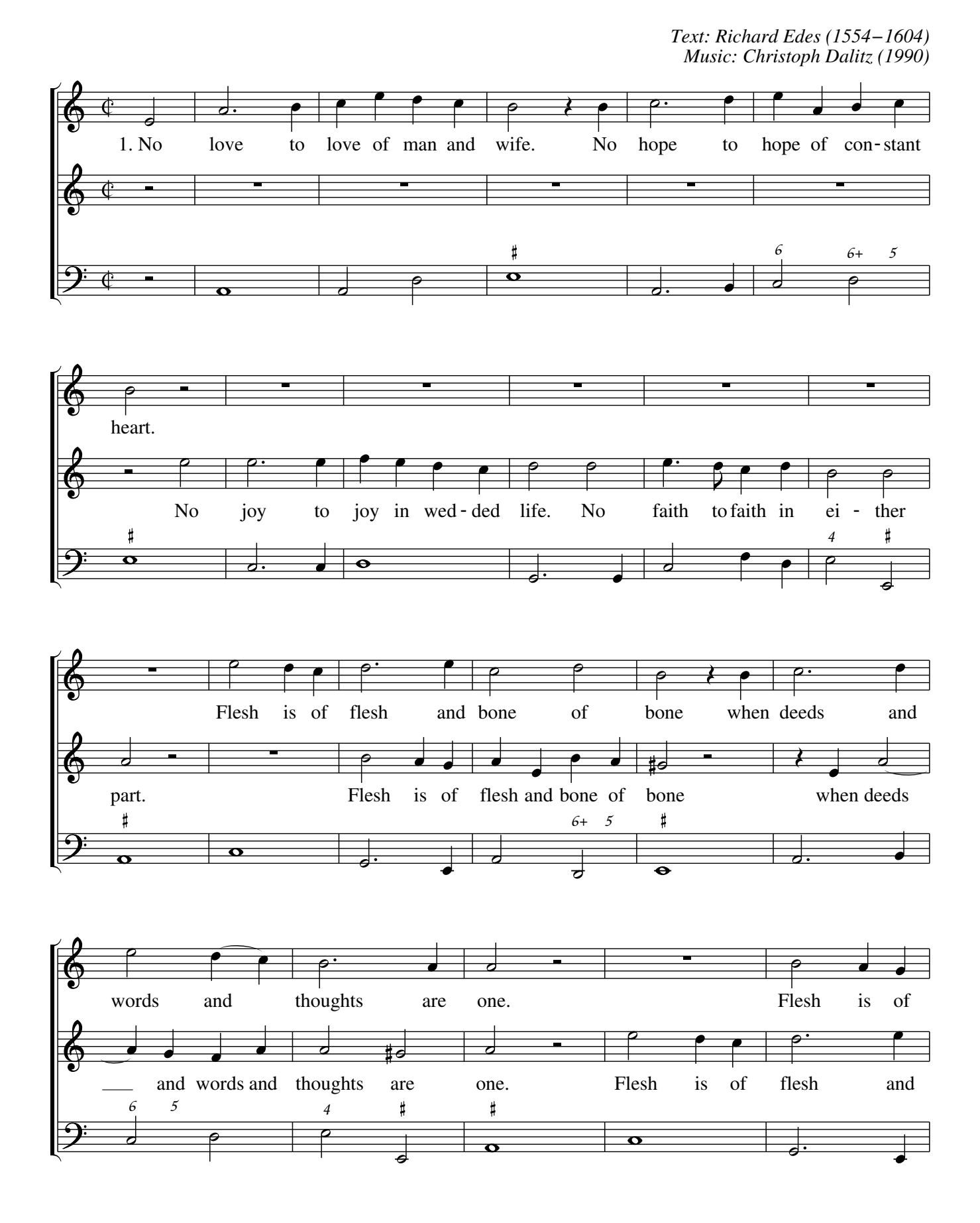
Of Man and Wife Edition for high voices (SS or TT) and basso continuo