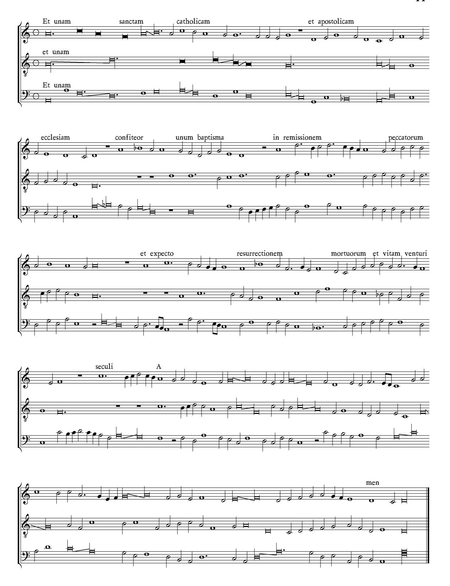
Jaques Barbigant – Trento: tr89 308v-311r