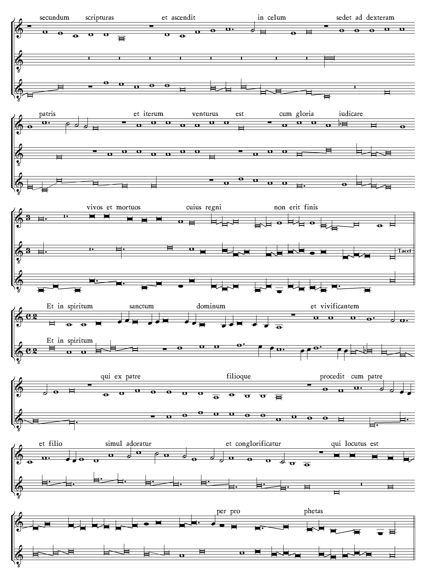
Jaques Barbigant – Trento: tr89 308v-311r