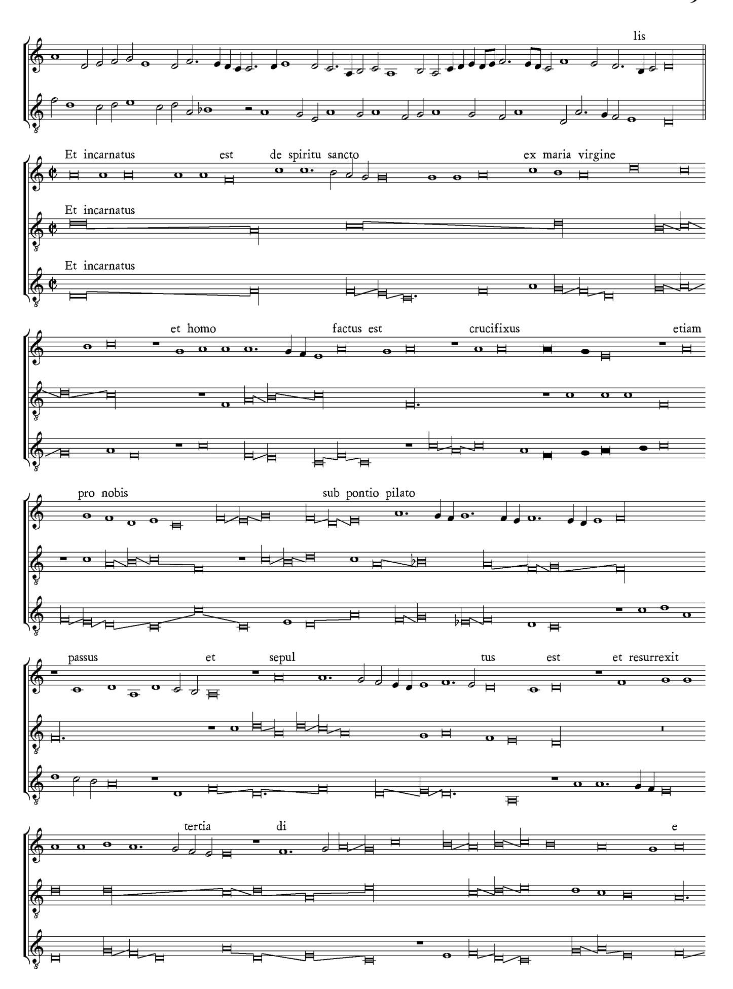
Jaques Barbigant – Trento: tr89 308v-311r