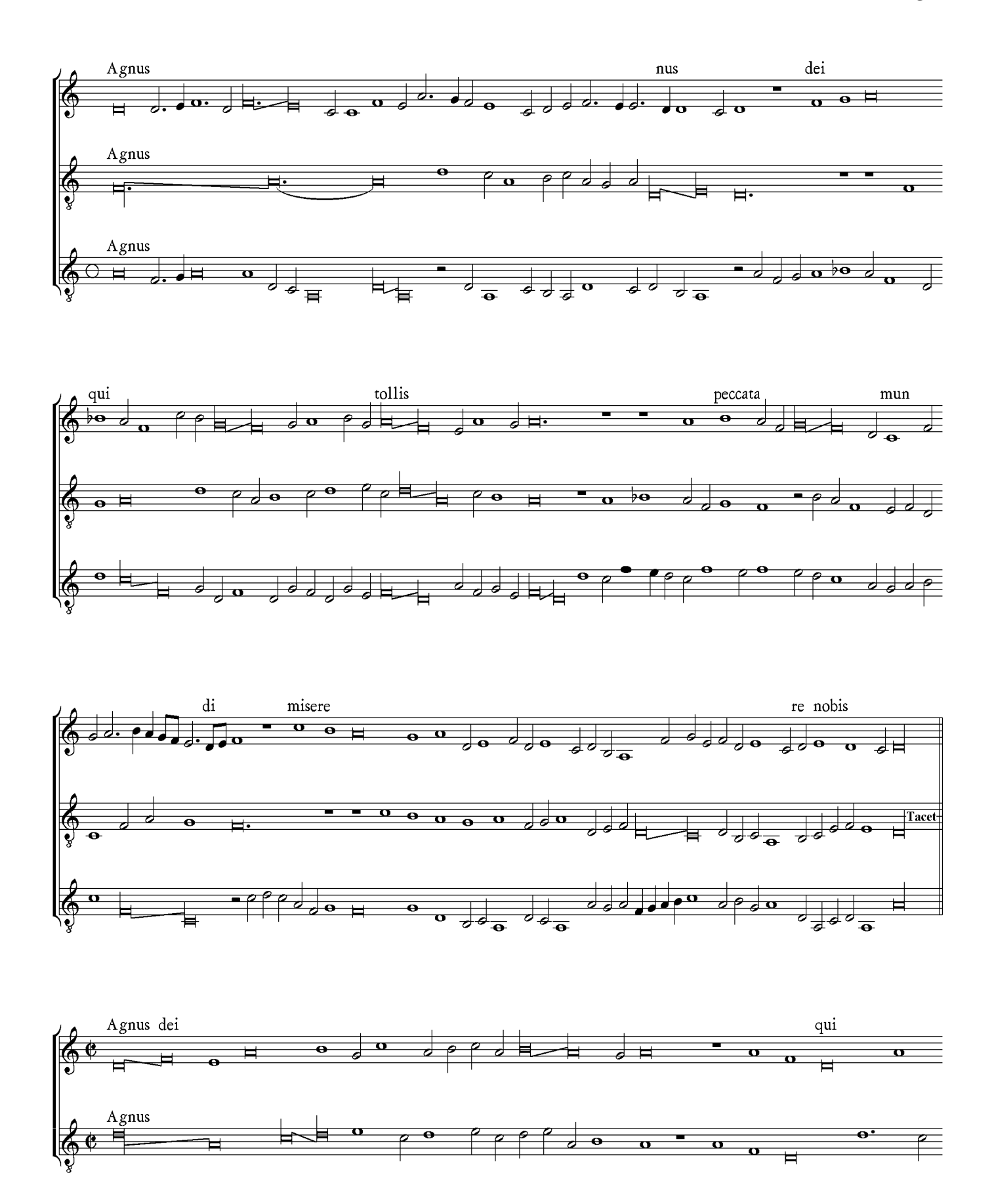
Jaques Barbigant – Trento: tr89 313r-315r