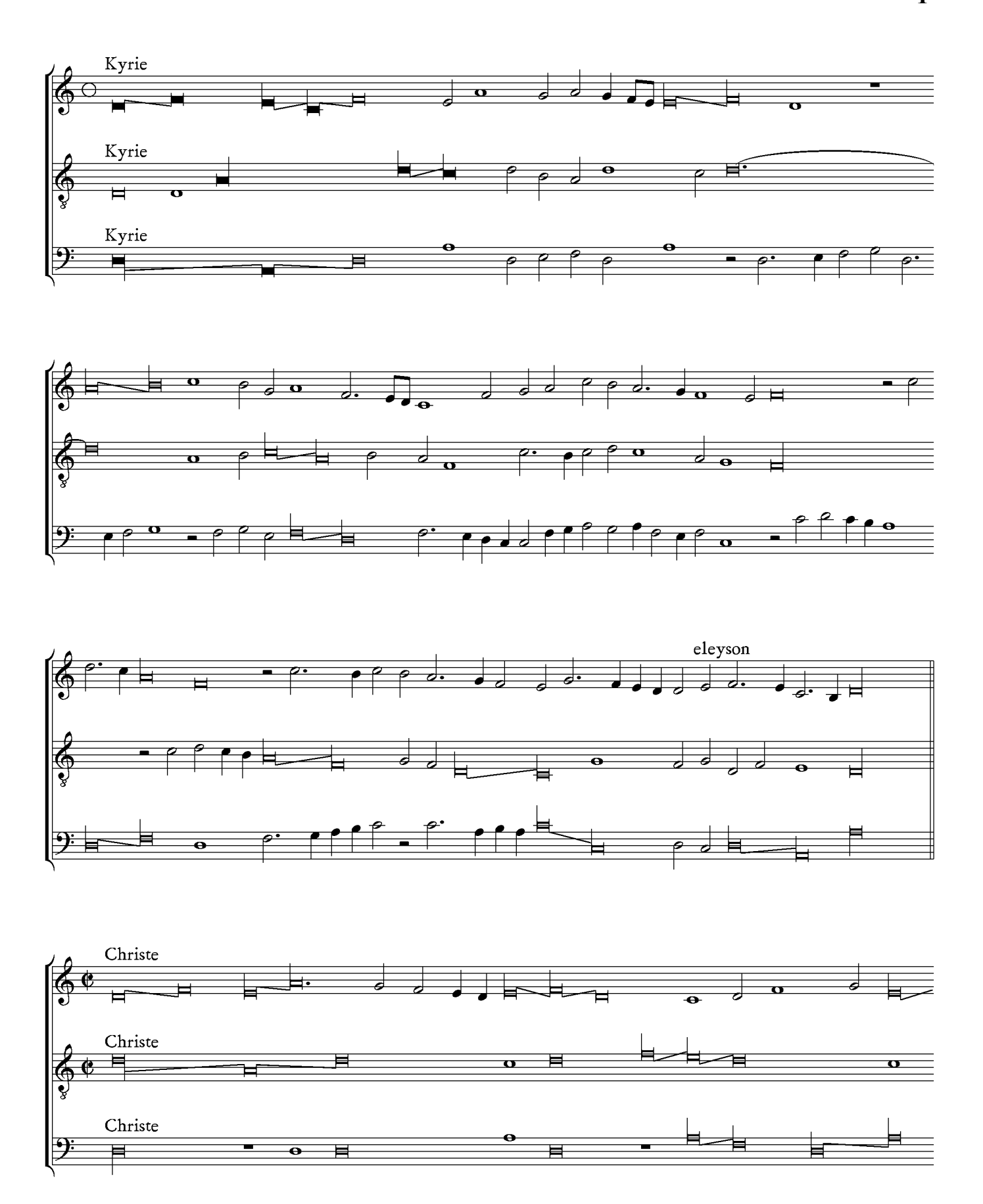
Jaques Barbigant – Trento: tr89 306v-307r