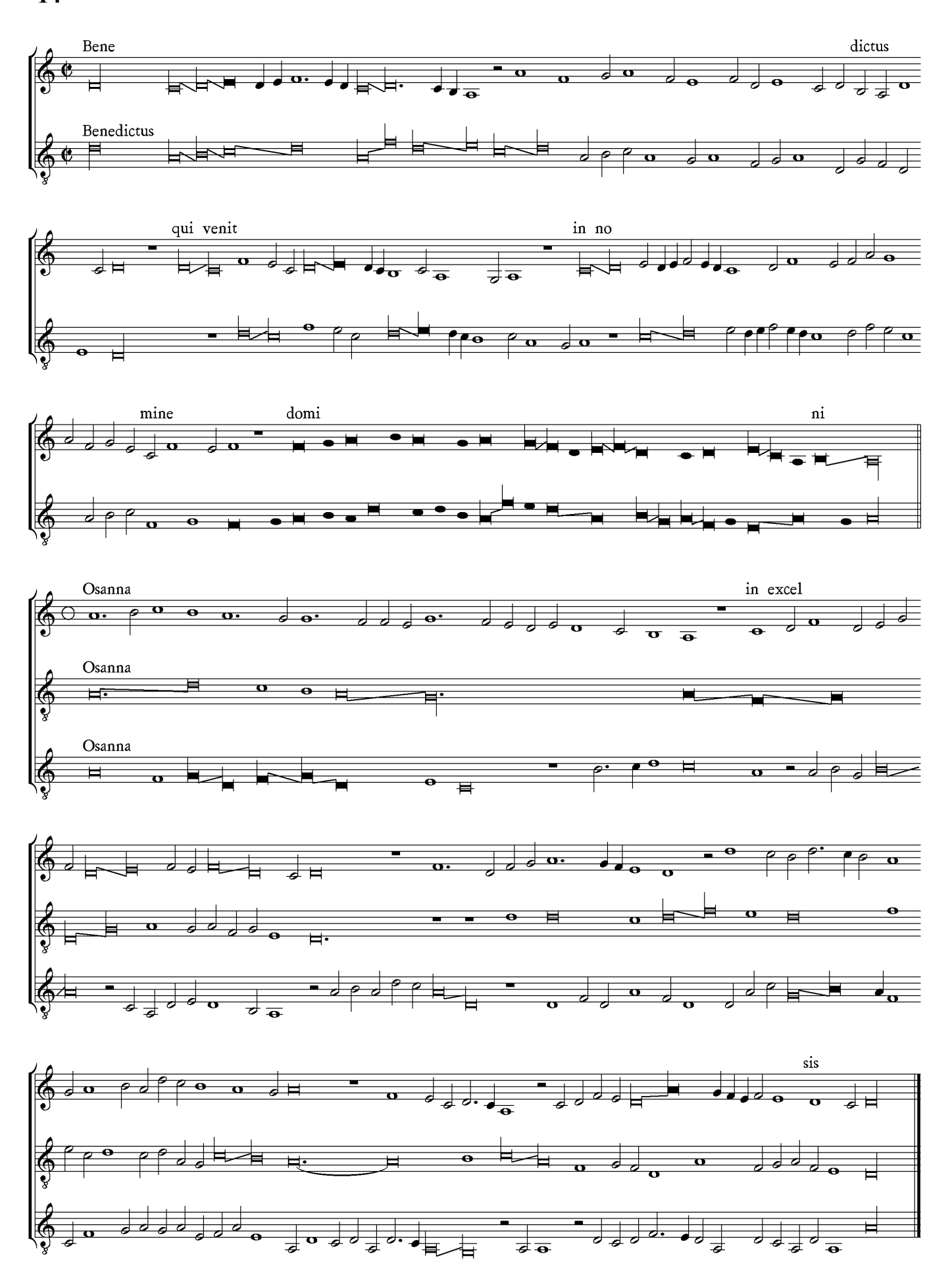
Jaques Barbigant – Trento: tr89 311v-313r